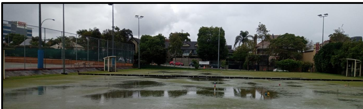
Cammeray lawns during the CNSW Silver Singles

This was played at Cammeray, and was plagued by torrential rain. Much of the time was spent using the super-sopper to make at least one lawn playable.