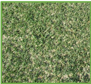
close up of the couch grass

Much work has been done on our lawns recently. Mike Stokes the Council groundsman who looks after them, is an expert on grasses, and has done a wonderful job. Our lawns had acquired a range of different grasses over the years, which is not good for croquet, but Mike has been removing all the grasses except couch, so we now have a splendidly uniform lawn. The lawns have also been top-dressed and fertilised and are looking magnificent.