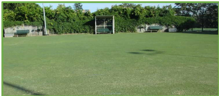
general view of the lawns