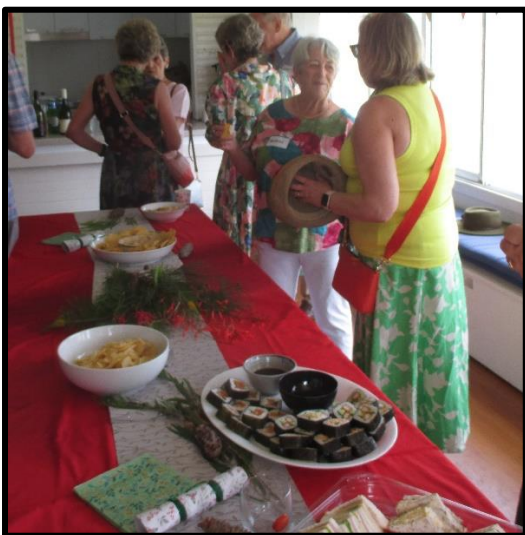
Some of the fine food provided