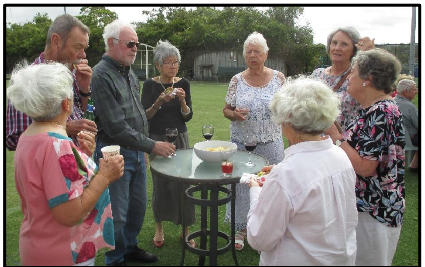
The weather was kind to us!