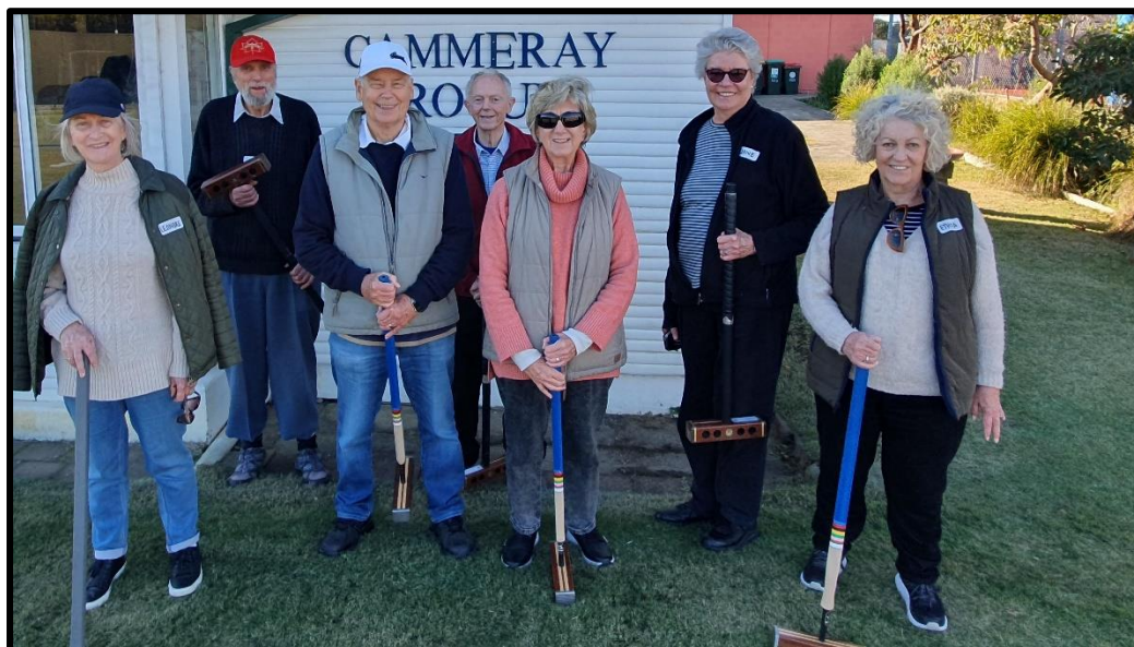
Members of the Waverton Hub trying croquet