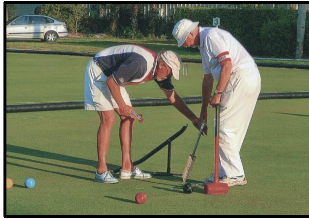
Fixing hoops at the World AC Championships in Florida