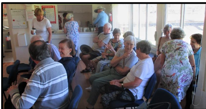
Members gathering before the meeting