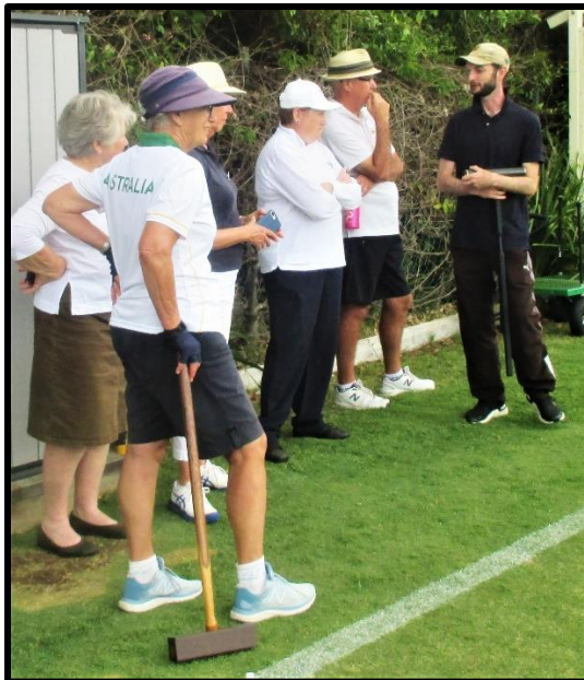
Players watching the games