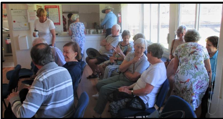
Members gathering before the meeting