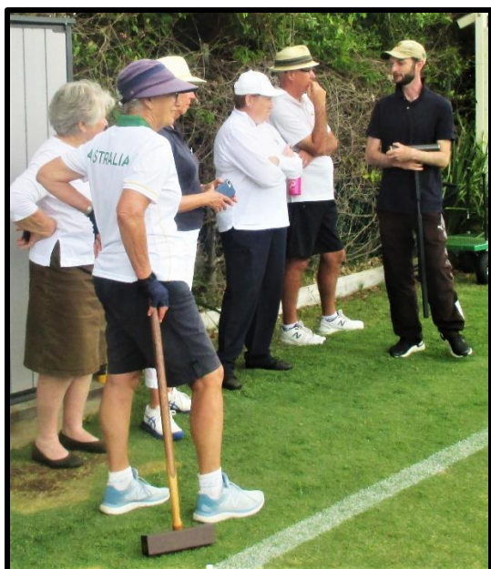
Players watching the games