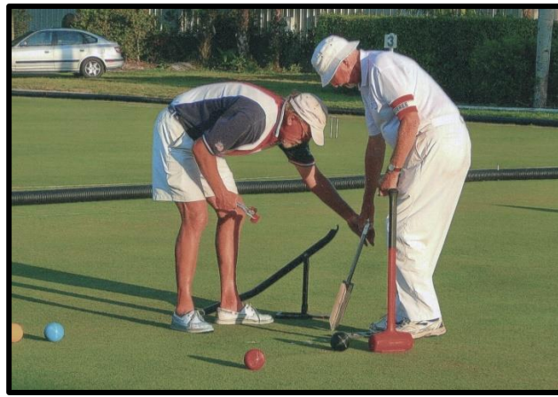
Fixing hoops at the World AC Championships in Florida