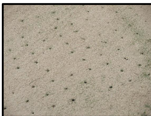
Lawns on 11 th January showing top dressing and coring